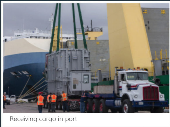
Receiving cargo in port

The cargo is fully insured the moment we begin the job, so you can rest assured knowing your cargo is in good hands