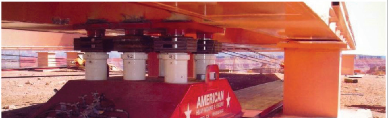
The jacking & rigging technique was used to place the Grand Canyon Skywalk with precision placement and lift

Utilizing advanced technology and techniques we have perfected the art of safe and efficient heavy haul transportation. The key to safe transport is eliminating unnecessary steps and movement, thus keeping cargo secure.