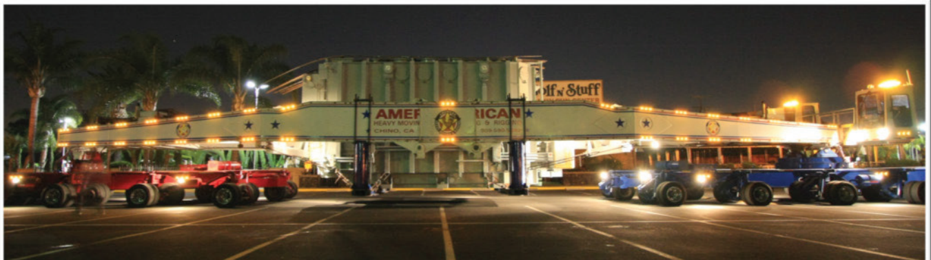
The Alpha 1 dual lane trailer

Our trucks are uniquely designed to minimize additional movement. We can precisely slide cargo onto pads or even bring the trucks around the cargo and secure it from the sides. Our trucks are able to adjust their axles while load bearing to adapt to changing road conditions without putting cargo at risk from additional loading and unloading.