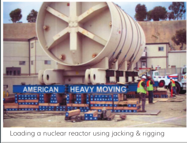
Loading a nuclear reactor using jacking & rigging