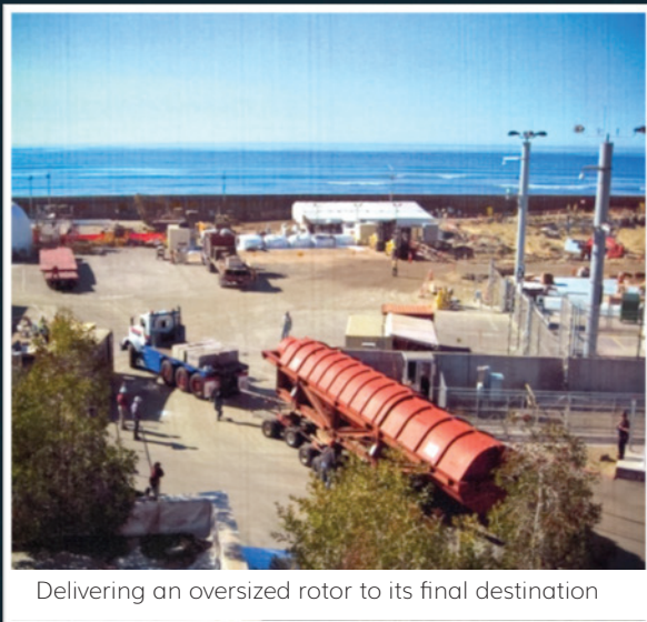
Delivering an oversized rotor to its final destination

Excellent relationships with permitting agencies, allow us to work quickly and efficiently.